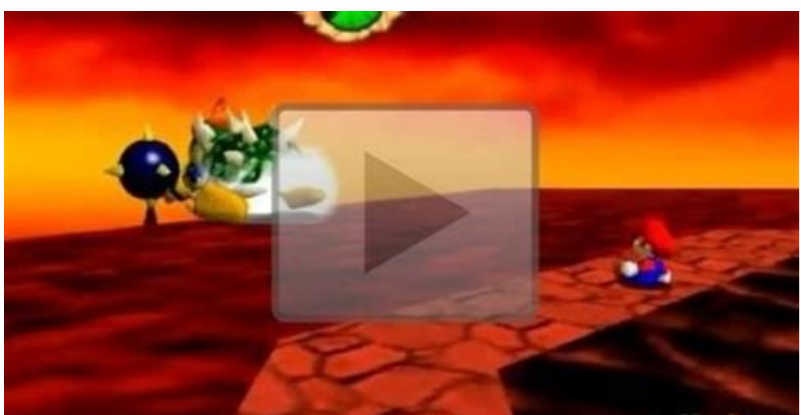
Super mario 64 ds speedrun guide. Super mario 64 16 star speedrun guide.